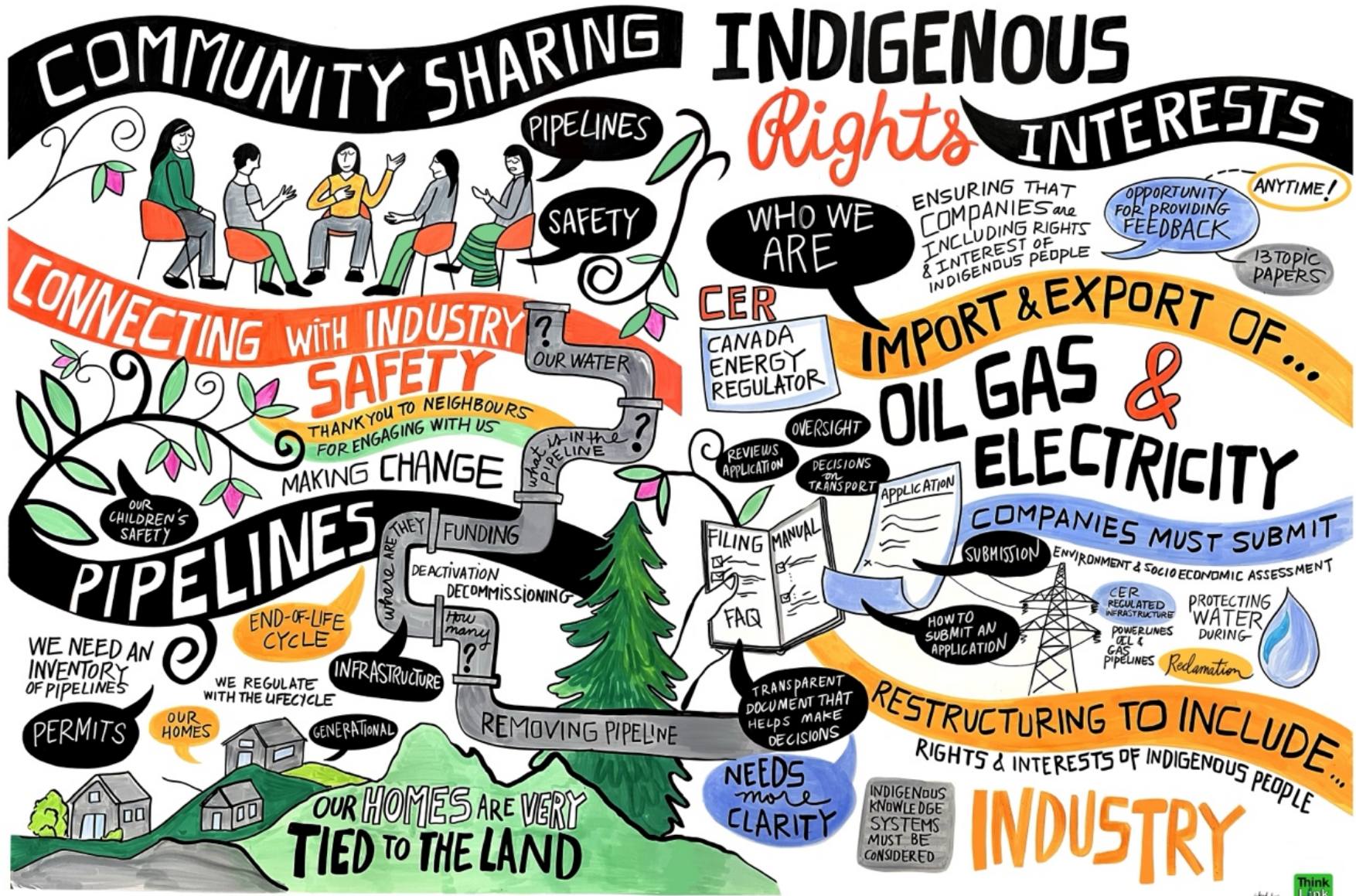
Figure 16. Day Two: Closing Graphic Summary.