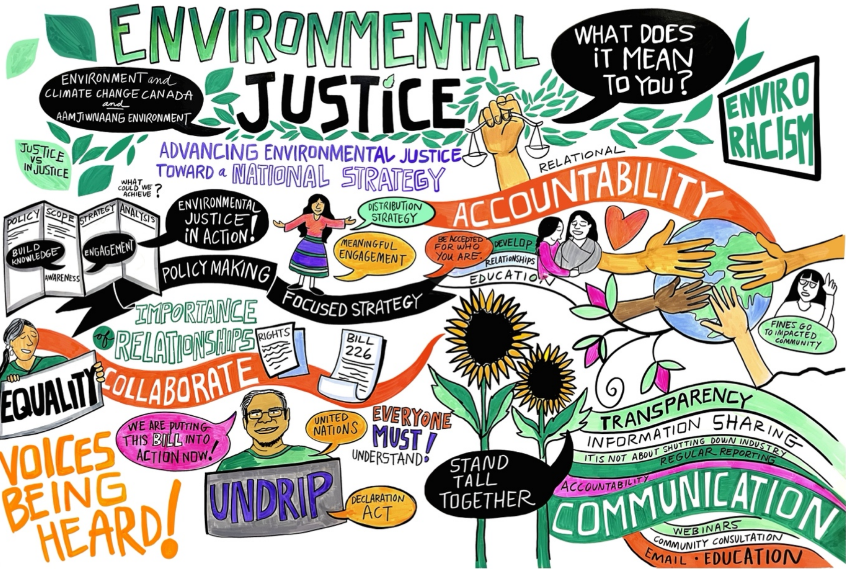
Figure 8. Day One: Afternoon Graphic Summary.